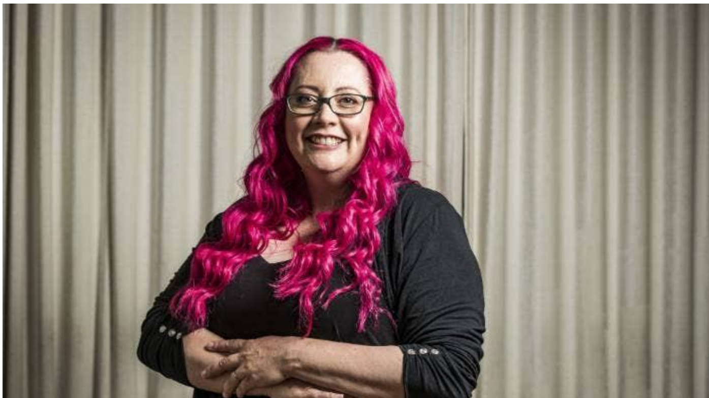
The World Economic Forum meeting in Switzerland used of the most effective protections we have against Covid, proper air ventilation, Siouxsie Wiles writes.

But what the protocol also reveals is that the World Economic Forum was quietly using one of the most effective protections we have against Covid – properly ventilating the air. In fact, they'd even installed “additional state-of-the-art ventilation systems... in areas with restricted air circulation”.