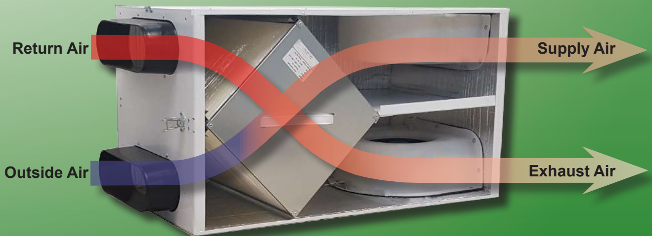
HEX390 Heat Exchange unit